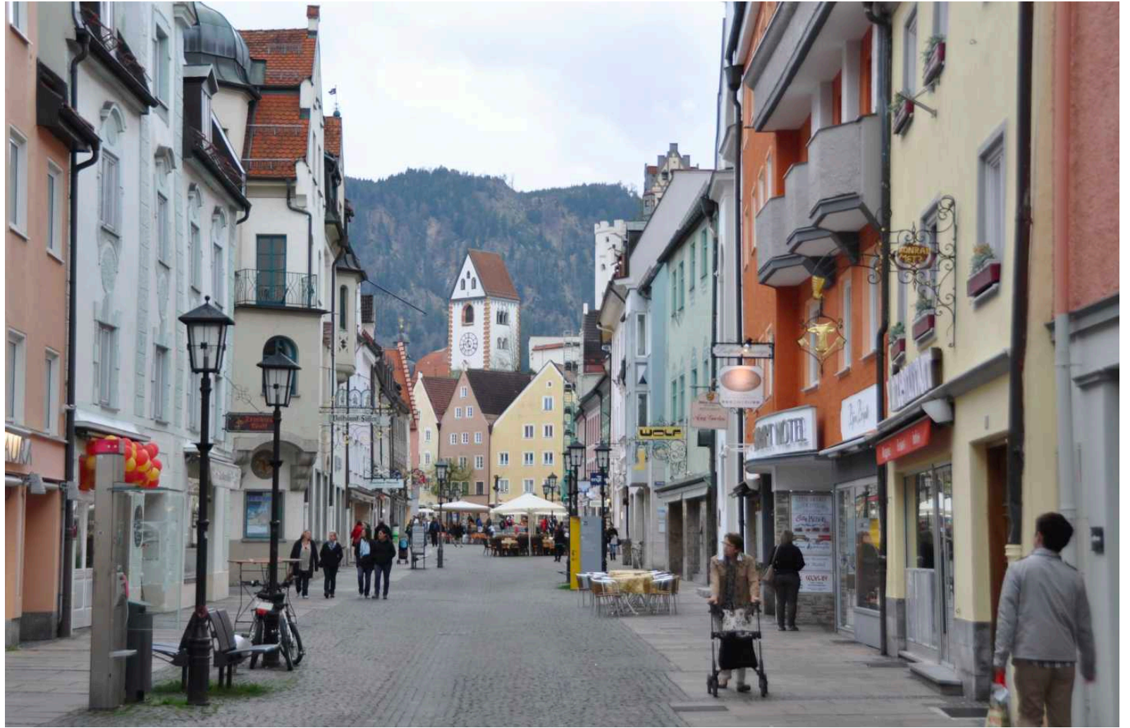
Bavaria is dotted with cute, colorful, cobble towns like Füssen, above, near the Austrian border in the Alps.

Ludwig, who inherited the throne at age 18, did not want to deal with politics. He instead focused on constructing the fanciful Neuschwanstein Castle just up the hill and decorating it with images of medieval lore: brave knights, fair maidens and scenes from Wagnerian operas. Just a few months after he moved into Neuschwanstein, Ludwig — who was already planning an even more extravagant castle — was declared mentally unfit to rule. Two days later, he was found dead in a lake. People still debate: Was it murder — as he was nearly bankrupting his kingdom with his costly castle building — or suicide? But today nobody complains about the cost of his castles. In fact, within