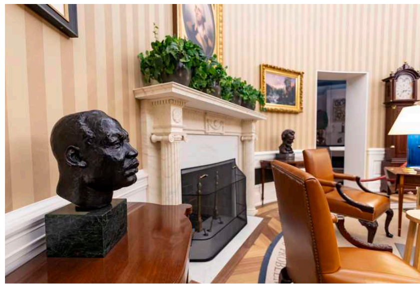
Above: A bust of the Rev. Martin Luther King Jr. displayed in a replica of the Oval Office at the Obama Presidential Center. Top: The Obama Presidential Center on June 3 ahead of its opening.

TRIBUNE EDITORIAL: The editorial board says the Obama Presidential Center represents an unprecedented $850 million investment in Chicago's South Side, coming at a time when Chicago really can use the shot in the arm. Opinion, Page B1