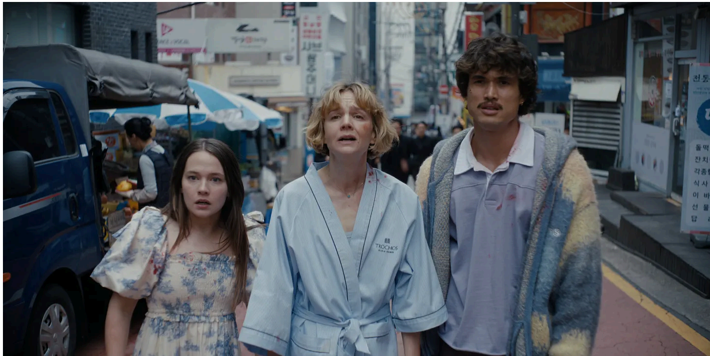
Cailee Spaeny, Carey Mulligan, Charles Melton.