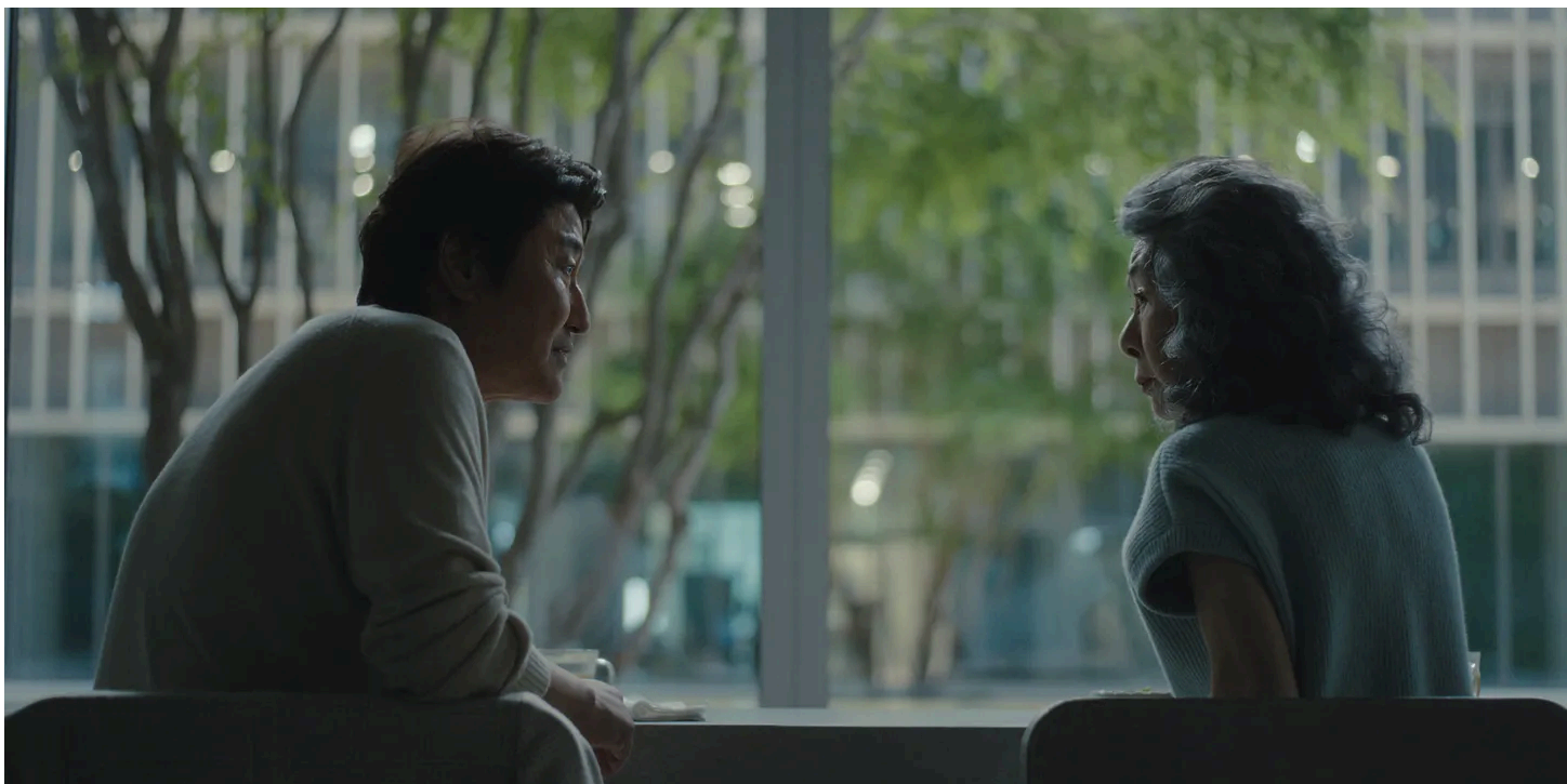
Song Kang-ho, Youn Yuh-jung

° Song Kang-ho portrays Dr. Kim, the Chairwoman's plastic surgeon husband. Though famous for his skills, his hand tremors and reticence to stop practicing have made him a liability. After he accidentally kills one of his patients, the Chairwoman springs into action to save his reputation and her wealth.