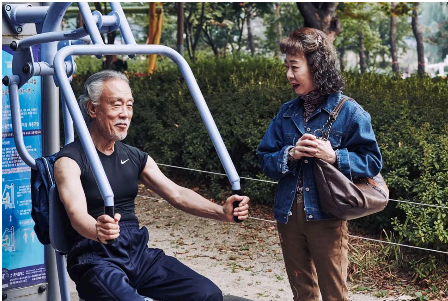
Youn Yuh-jung (right) in The Bacchus Lady.

META MOMENT: In Episode 3, Ashley asks Austin if she should put Bacchus drinks in a gift basket for Eunice. He tells her that the only person he's ever seen drink it is his grandmother. That scene is a sly nod to Youn Yuh-jung's 2016 film, The Bacchus Lady . 2 In the titular role, Youn starred as an elderly sex worker who sold Bacchus