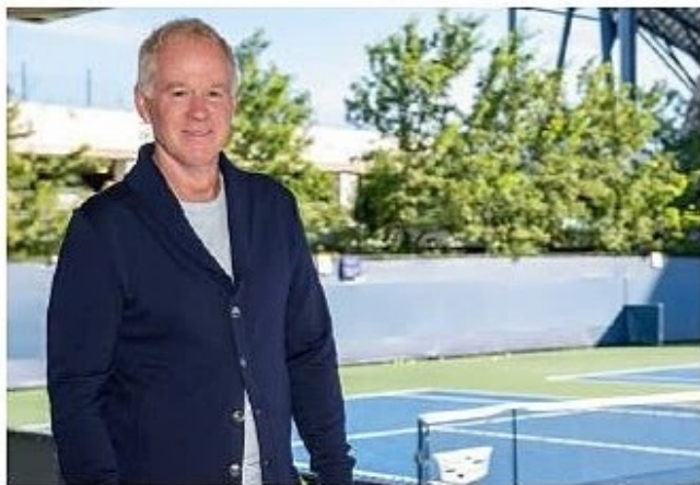
Tennis analyst Patrick McEnroe hopes to take his family to Ireland this summer.

A: It happens once in a while. When I was younger and living in New York, especially playing in Central Park, I'd get challenged all the time by local players. These days, it's less common, but every now and then someone will joke about it. I usually tell them it might not be the smartest idea.