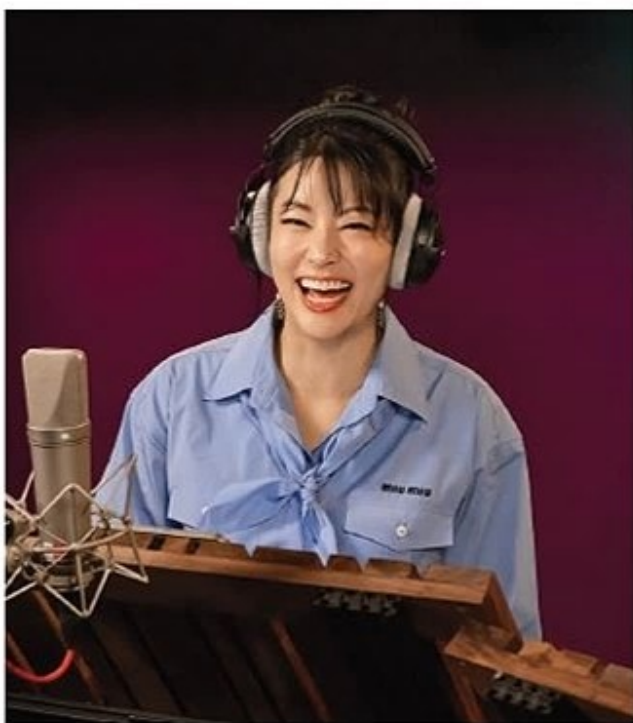
Arden Cho said that voicing the lead character in "KPop Demon Hunters" was one of her favorite jobs.

A: I was born in Texas and I am American ... but I'm a child of immigrants. So I sort of experience the world from both sides. The older I get, I'm always questioning (my identity), too. What does it mean to be Korean American