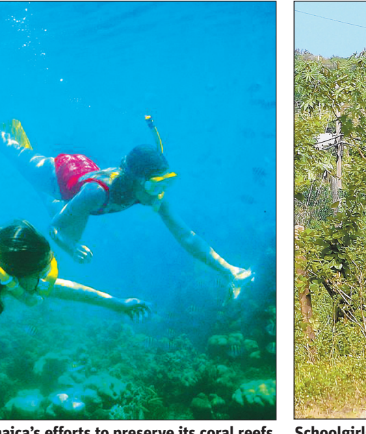
Jamaica's efforts to preserve its coral reefs have been successful.